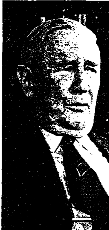
Dr. Nahum Goldmann

Dr. Nahum Goldmann stated yesterday that on the eve of the establishment of Israel, Egyptian diplomats in Washington and Europe had proposed a meeting between Zionist leaders and the then Premier of Egypt, Nokrashy Pascha.